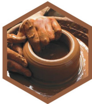
Artisans, Industries and Livelihood