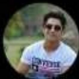
Harsh Beniwal YouTube Sensation